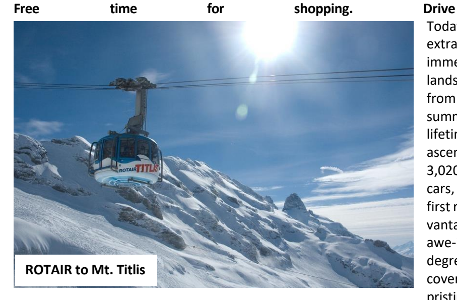
Day 5 Visit Mt. Titlis- enjoy Cable car rides including the world's first rotating cable car, the Rotair – to the top of Mt. Titlis at 3,020 metres. Orientation tour of Lucerne.

to Lugano. Today holds the promise of an extraordinary adventure as you immerse yourself in the breathtaking landscapes of Switzerland. Check out from the hotel as we proceed to the summit of Mt. Titlis, a once-in-alifetime experience that involves ascending to an impressive altitude of 3,020 meters through a series of cable cars, including the Rotair, the world's first revolving cable car. From this lofty vantage point, you'll be treated to an awe-inspiring, unobstructed 360degree view of the glistening, snowcovered peak, deep crevasses, and pristine white snowfields adorned