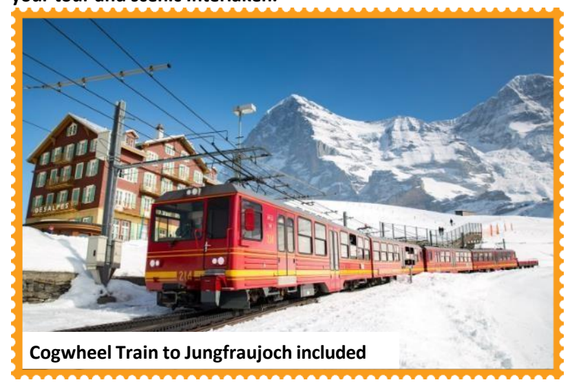
Day 4 Enjoy a magical alpine excursion to the top of Europe - the amazing Jungfraujoch which is included in your tour and scenic Interlaken.

Get set for a memorable magical alpine excursion to Jungfraujoch -The Top of Europe, a high-point of your tour. First proceed Grindelwald Terminal. The new 3S-Bahn Eiger Express takes you from the Grindelwald Terminal to the Eigergletscher station in just 15 minutes. There you board a cogwheel train to reach the highest railway station in Europe at 11,333 feet – a world of eternal ice and snow. Visit the Ice Palace where artistes create their work of art in ice. Visit the Sphinx observatory deck to experience а breath-taking